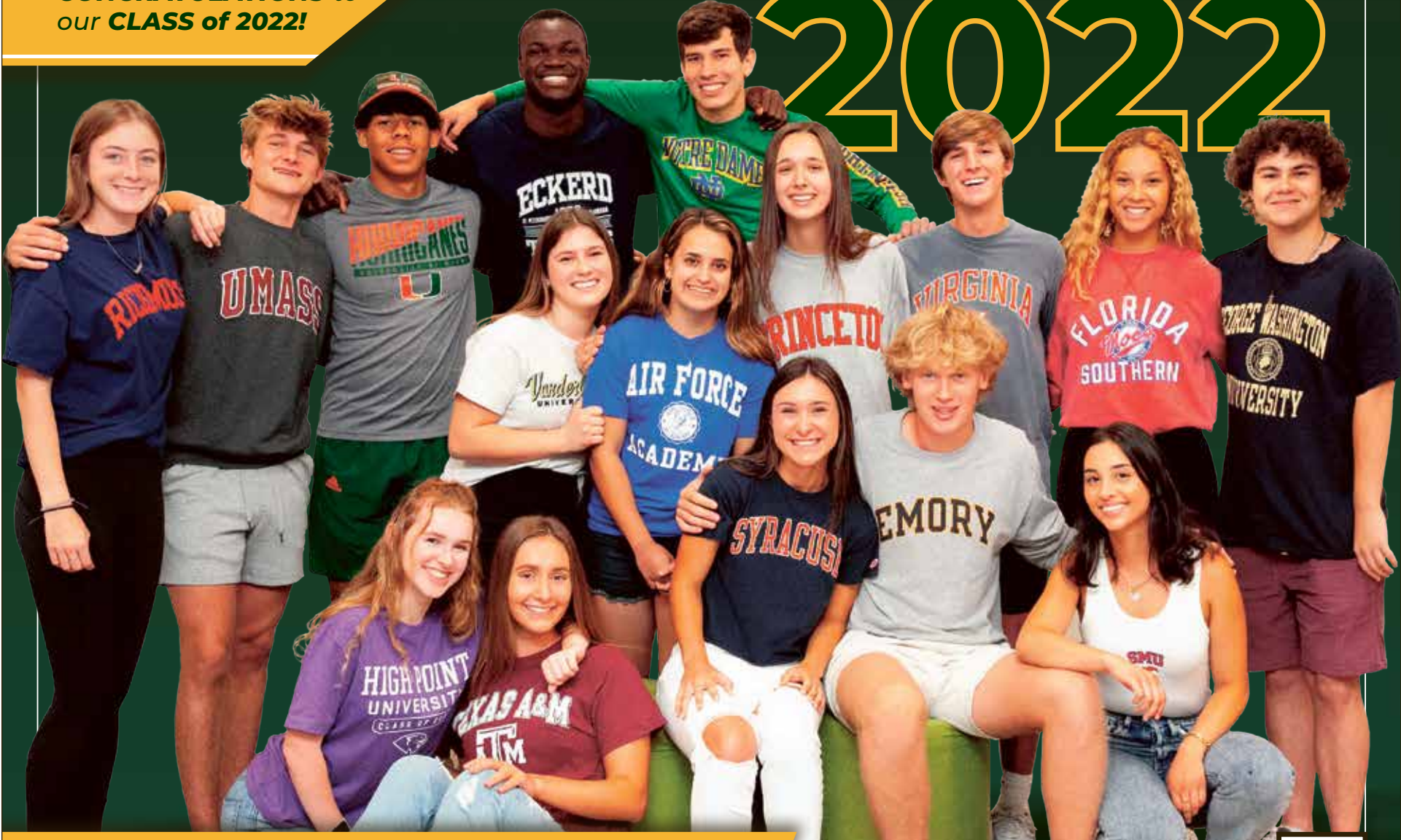
Serving a diverse community of students from 3 years old through 12th grade

Shorecrest | Preparatory School 5101 1st St. NE, St. Petersburg, FL 33703 | 727-522-2111 | shorecrest.org